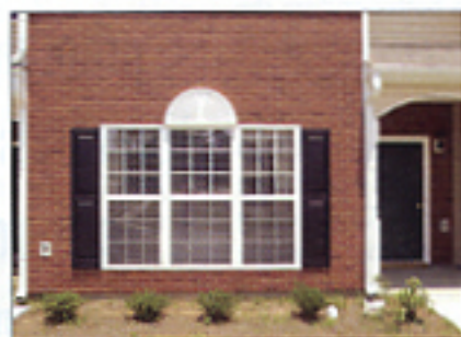
Fiber cement siding profiles have the appearance of stone, brick, or shake.