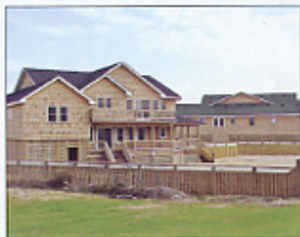
LifePine pine siding resists fire and moss and fungus growth.